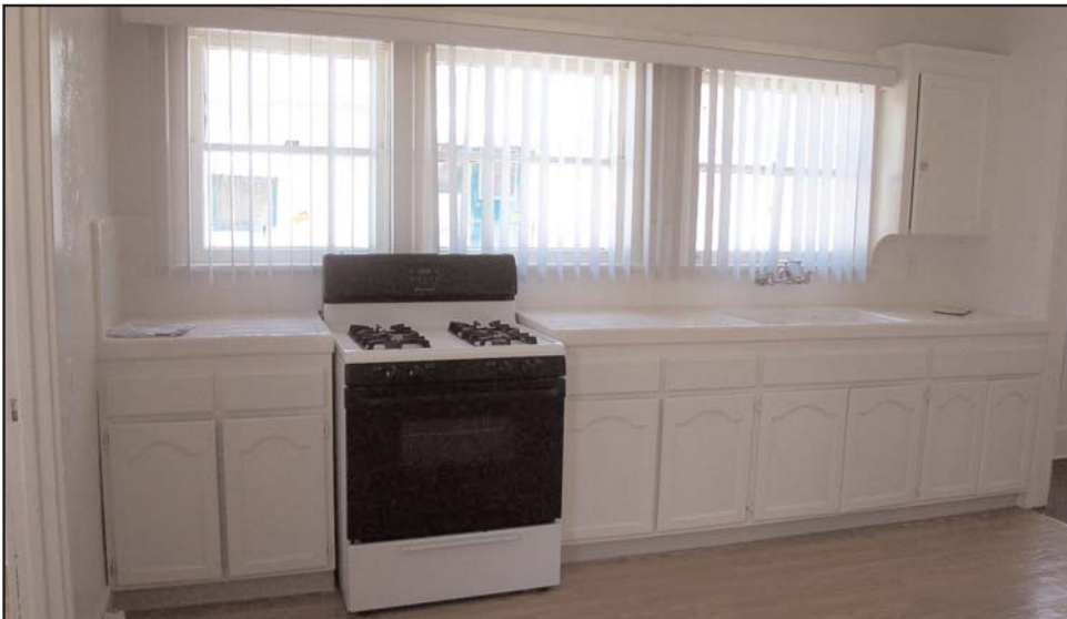
Recently remodeled kitchen in the main house