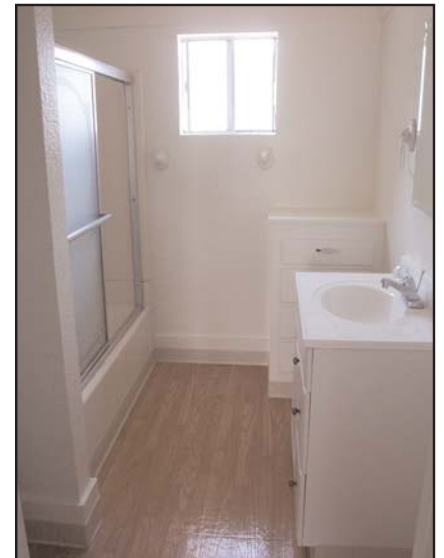
Bathroom with built-in drawers