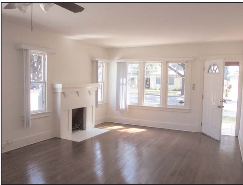
Living room with fireplace and picture windows