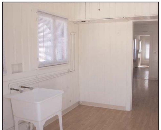
Utility room in the main house