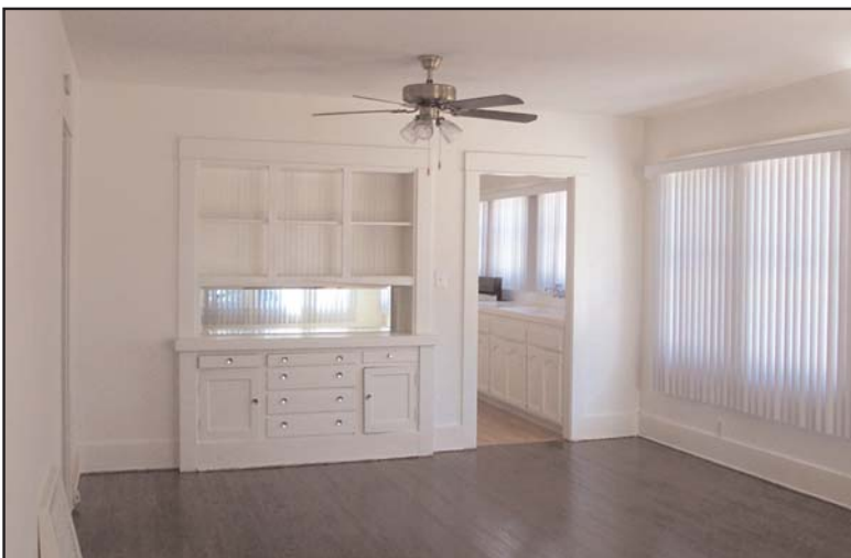
Dining room with built-in hutch and picture windows