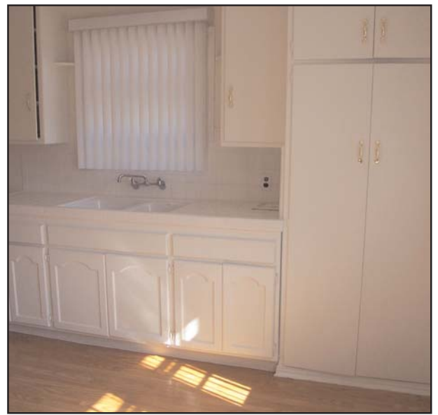
Recently remodeled kitchens in the apartments