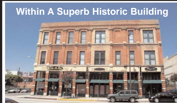
Within A Superb Historic Building