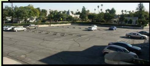
Private Parking Lot