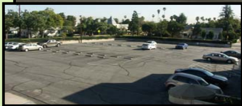
Private Parking Lot